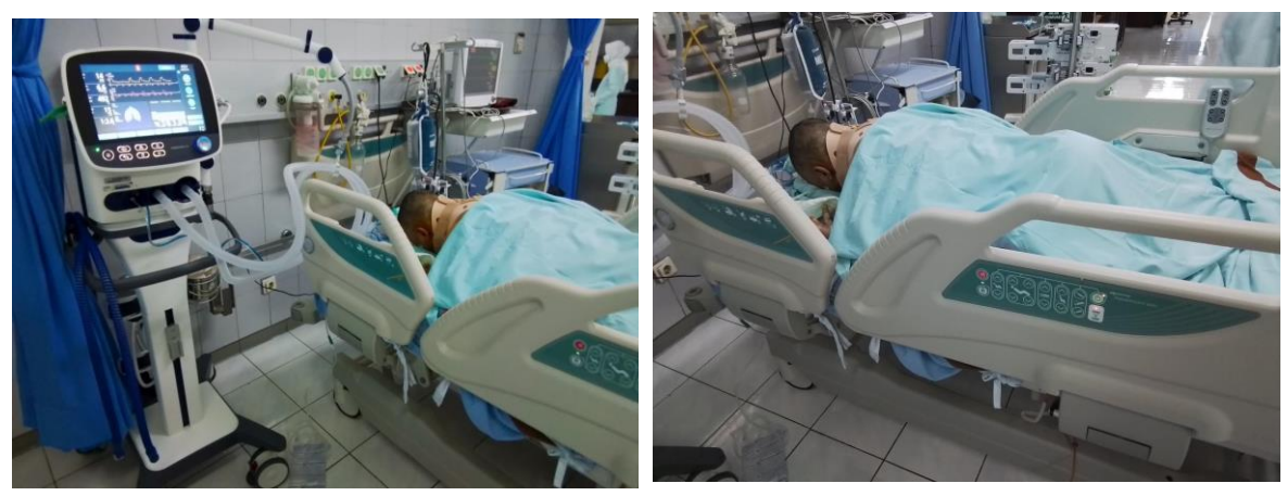
Gambar 2. Postoperative clinical conditions and patient's position.