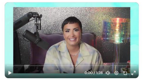
2:10 PM · May 19, 2021

Every day we wake up, we are given another opportunity & chance to be who we want & wish to be. I've spent the majority of my life growing in front of all of you... you've seen the good, the bad, & everything in between