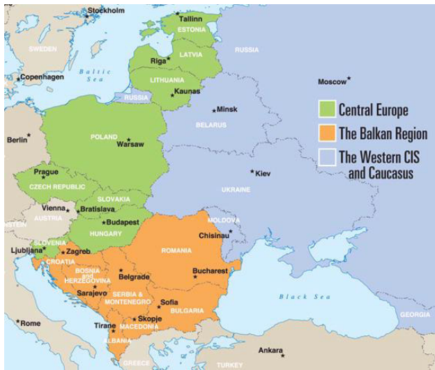
Figure 1. The Map of Eastern Europe.