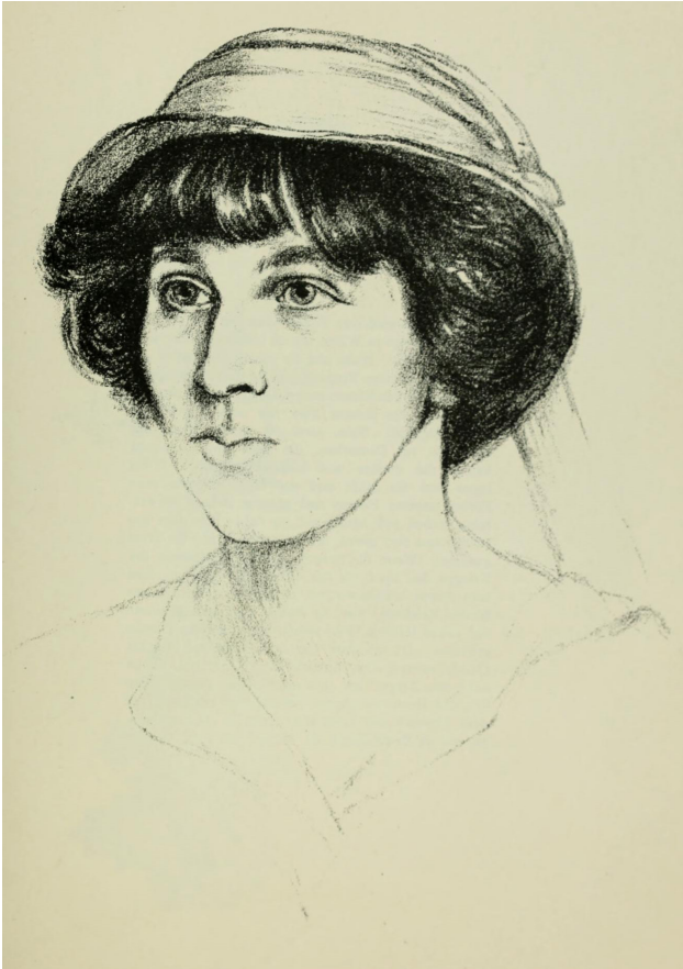
Figure 4. Painting by Hermann Struck