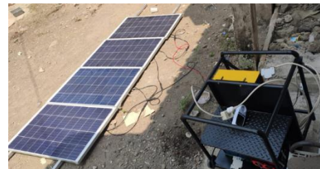
Figure 2. Portable power station with removable solar panels