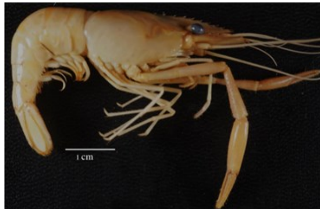
Figure 2. Macrobrachium sundaicum in Selat Panjang Island, Riau Province.

Prawn coloration morphologically, the obtained specimens are very similar to the original description of M. sundaicum described by Wowor & Ng (2010) . The specimens from Selat Panjang Island have short rostrum, with tip not extending beyond distal end of scaphocerite but extending beyond distal end of third segment of antennular peduncle or tip slightly extending beyond distal end of scaphocerite in young specimens. The rostrum was armed dorsally with at least with 9-12 teeth (mode 11), 4 teeth completely postorbital (3 or 4 in other specimens, mode 4). Ventral carina with 4–6 teeth (mode 5). Second pereopods dissimilar in shape, unequal in size, robust and fingers covered by soft dense pubescence especially in adult specimens. Second pereopods with carpus shorter than chela and merus subcylindrical (Figure 2). This finding shows the presence of M. sundaicum in Selat Panjang Island, Riau Province is new record for this species.