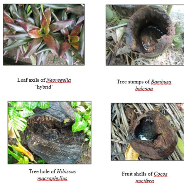
Figure 2. Different types of phytotelmata that were found.

There were 4 types of phytotelmata found in this research namely leaf axils, tree stumps, fruit shells, and tree holes (Figure 2).