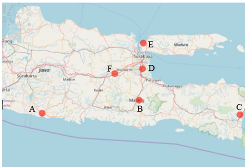
Figure 1. Research area of entomological survey were signed by red circle (EpiInfo, 2019).

The entomological survey was conducted during rainy season and pre-dry season (January to June 2017) in an area that represented as high dengue risk in East Java Province that is Pacitan, Sidoarjo, Malang, Jombang, Banyuwangi, and Bangkalan. Study areas were shown in Figure 1 with legend (A: Pacitan Residence; B: Malang Residence; C: