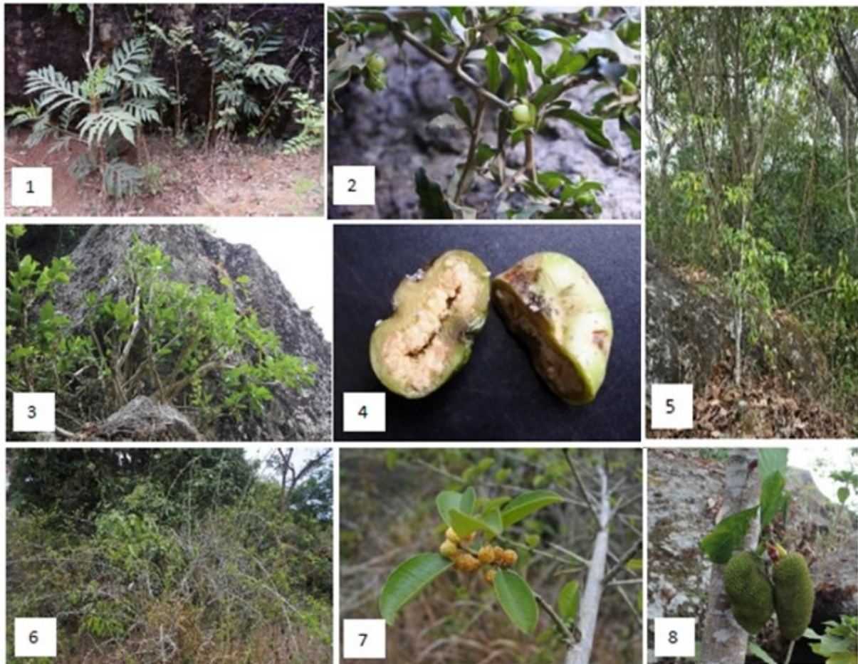
Figure 2. Species of Moraceae found in Nglanggeran were A. altilis (1), S. taxoides (2), F. septica habit (3), F. septica inflorescences (4), F. benjamina (5), M. cochinchinensis habit (6), M. cochinchinensis inflorescences (7), A. heterophyllus (8).