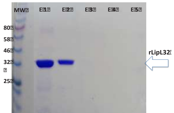
Figure 1. SDS-Page (12.5%) of purified recombinant LipL32 protein. LipL32 protein was eluted in fraction 1 (E1), fraction 2 (E2), fraction 3 (E3), fraction 4 (E4) and fraction 5 (E5). 10 \mu l of each fraction was analyzed to confirm the size and purity of LipL32 protein. The blue arrow showed the LipL32 protein with correct size 32kDa and high purity (>90%).

will be categorized as a positive reaction, while the OD less than 0.5 as a negative reaction.