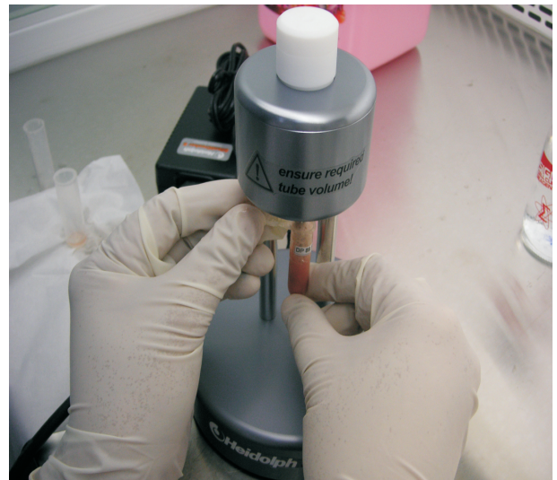
Fig. 1. Pooled of whole bodies and abdomen parts of collected of the house flies (1 A). Homogenizing the house flies (1 B).