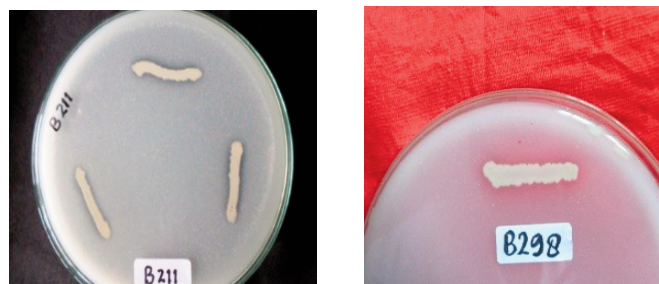
Figure 2. Bacillus subtilis as a phosphate solvent shown by a clear zone formed around the colony of Bacillus subtilis isolates