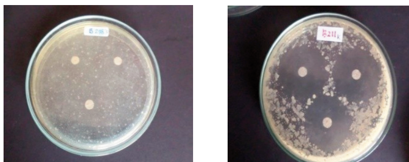
Figure 4. Bacillus subtilis resistance to antibiotics (Rif + ) and not resistant to Kanamycin, Streptomycin, and Chloramphenicol