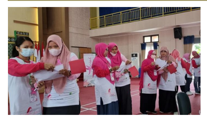
Figure 3 . Participants involved in the community service activity