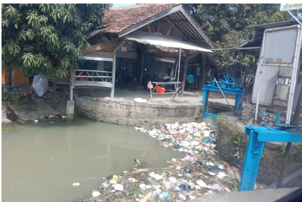
Figure 1 . River conditions

One of the areas mentioned in the local regulation is a tourist attraction in Tirtayasa Village, so therefore to support the tourism development plan in Tirtayasa Village need socialization of clean and healthy life changes as education for the development of self-awareness in the community to be able to change lifestyles and protect the environment for the better. To know the knowledge of the people in Tirtayasa Village related to cleanliness and healthy lifestyle, we would do a pre-test and post-test for the community in Tirtayasa Village, Serang Regency.