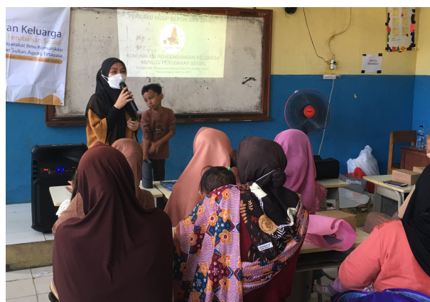
Figure 3 . Material giving activities

Table 3 shows a total sample of 41 people. However, 38 people attended (3 parents did not participate). There is an average increase with a difference of 1.59 from the average pre-test score of 5.92 and the post-test result of 7.51 and the significance value (2-tailed) was less than 0.05. The data also show a significant difference between the pre-test and the final post-test results, so there is a significant effect on differences in treatment or provision of information, specifically on the group of parents of grade 1B students. Overall, the 82 informants who did the pre-test and post-test could see a significant increase with the overall pre-test average score of 5.90 while the post-test average score was 7.62 resulting in a significant increase of 1.72. We present the results in more detail in the following Figure 5.