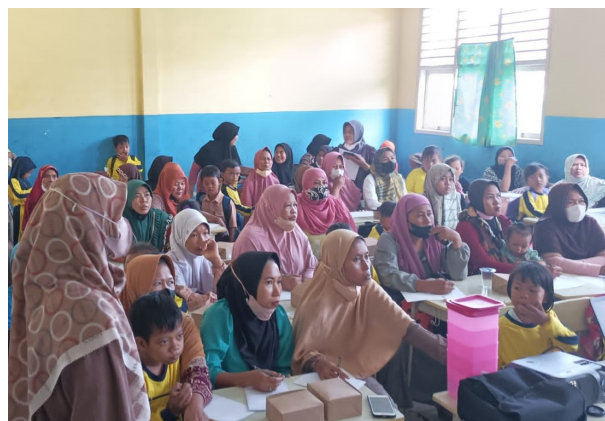
Figure 4 . The participants taking the post-test