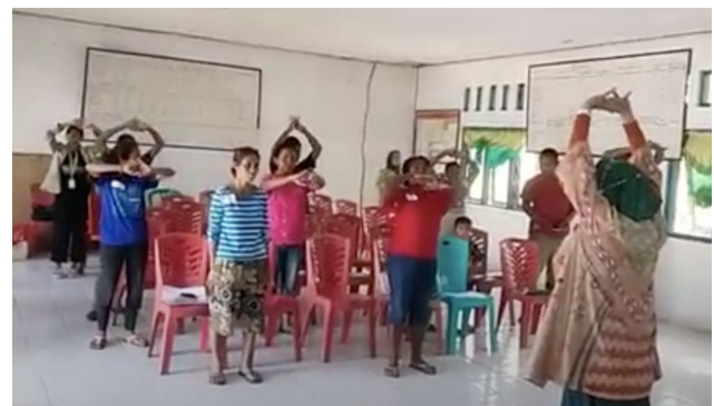
Figure 1 . Positive parenting training session

ended questionnaire responses into a table in Microsoft Excel and discussion transcripts in Microsoft Word. In the next stage, we created initial codes for further searching and reviewed the categorization and themes. Subsequently, we built a code system involving different colors in the label and memo feature in the qualitative application tools. In the final stage of thematic analysis, we defined and named the themes into a compilation of themes (code books). In addition to organizing the data using thematic analysis techniques, we combined the results with information from cross-tabulation to obtain descriptive statistics calculated from the frequency of segment units that formed themes or categories. The percentage size shows the appearance of segment units from each participant's answer in the two data sources (FGD and open-ended questionnaire) from the two post- and pre-test sessions in the two regions.