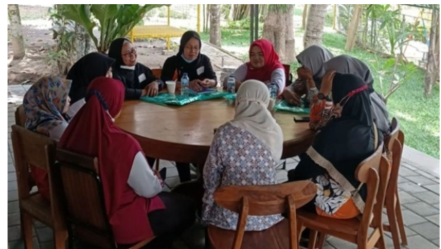
Figure 2 . Focus group discussion