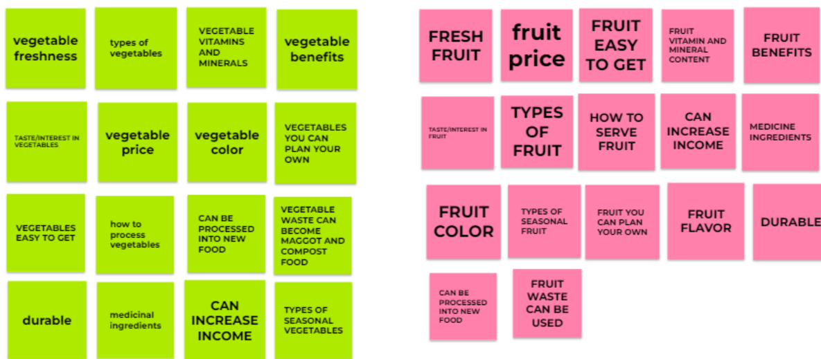
Figure 3 . Group three's online jam board

(3) When buying fruits and vegetables for the family menu, what knowledge do you generally think about the vegetables and fruits you buy (state as much information as you can about the vegetables and fruits you buy).