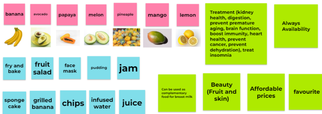
Figure 2 . Group two's online jam board

i) choice of type of fruit, ii) preparations that are commonly made for families, iii) Are there other things that are the basis for consideration (eg cost, season, price, preferences etc.)