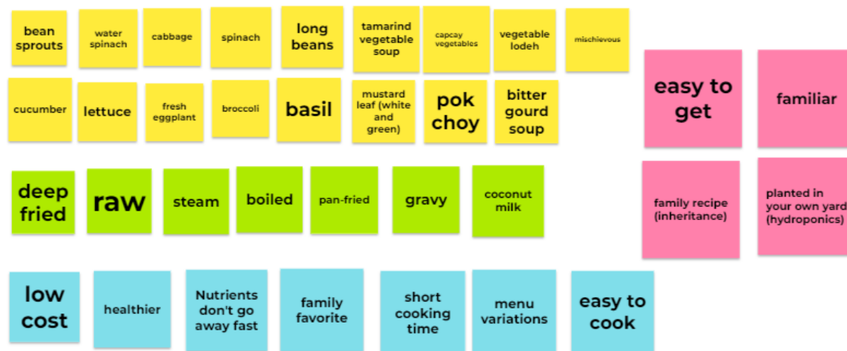
Figure 1 . Group one's online jam board

(1) When preparing food for the family, what considerations are made for the vegetable menu i) choice of vegetables, ii) preparations that are generally made for families, iii) reasons for considering the choice of types and preparations of vegetables). iv) Are there other things to be considered (eg cost, preferences etc.)