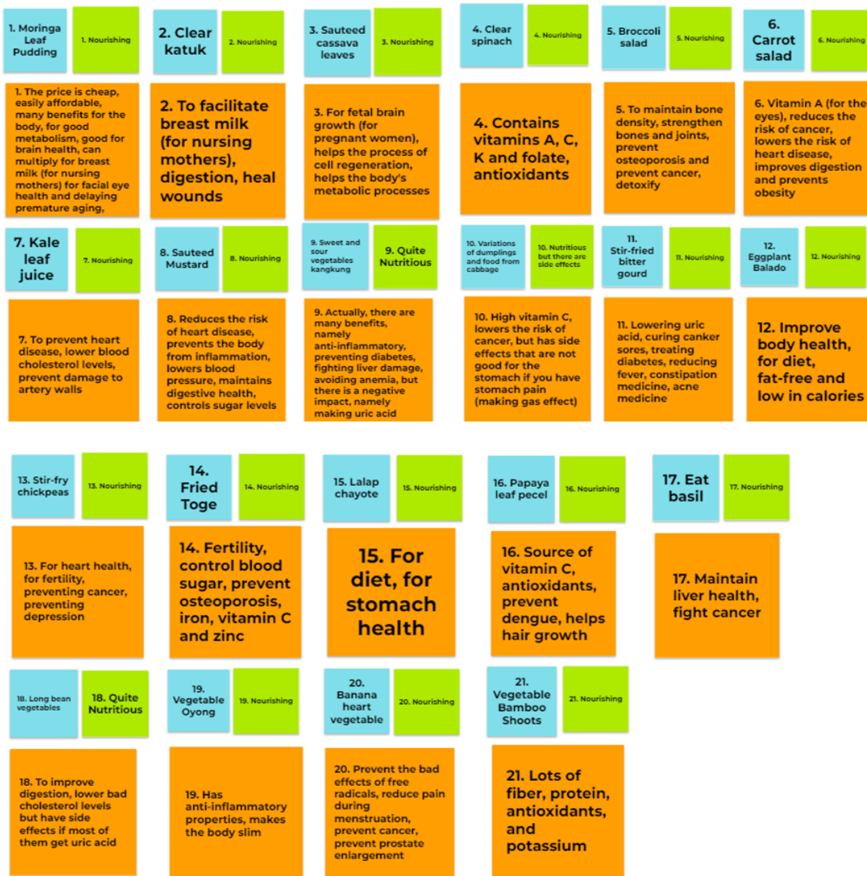
Figure 4 . Group four's online jam board

(4) In your opinion, are dishes (processed menus) made from vegetables in Indonesia (can mention examples of types of food) are healthy and nutritious foods? If yes, explain why, if not, why is it not nutritious? Answer briefly and clearly can use a comparison.