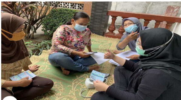
Figure 3 . Screening and education documentation

especially blood pressure, blood sugar, and hypertension. It can be said that job training is also carried out for cadres. High-quality evidence from RCTs or programmatic evidence from NRCTs regarding the effectiveness and costs or disadvantages of various screening strategies for hypertension (mass, target, or opportunistic) to reduce hypertension-related morbidity and mortality is lacking. However, in several studies and opinions that by screening, for individuals who have been diagnosed with high blood pressure, disease management programs are recommended to improve hypertension care. Disease management is an organized, proactive, multicomponent approach to the delivery of health care for a specific disease such as high blood pressure. Disease management programs involve tracking and monitoring individuals with high blood pressure by a coordinated care team to prevent complications and the development of comorbid conditions such as diabetes (Schmidt et al., 2020).