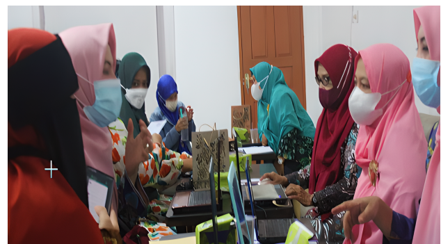
Figure 3 . The hands-on practice of the trainees in making interactive quizzes based on the Kahoot and Quizizz applications

At the end of the activity, a posttest related to interactive quiz material was carried out through the Kahoot and Quizizz applications. The posttest activity was carried out aimed at seeing the extent of participants' understanding and mastery of the material that had been given and to find out feedback from participants after the training so that the service team could follow up again during online guidance. Then each participant was given the task of implementing an interactive quiz using the Kahoot and Quizizz applications in learning (Figure 3). As agreed, assignments are collected through google classroom created by the service team.