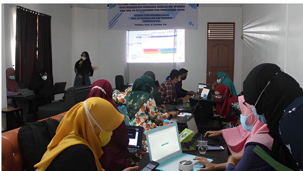
Figure 1 . Material presentation

Before the training started, the event was opened by the head of the service, after that the service team did a pretest by distributing some questions related to the material about the Kahoot and Quizizz applications. This pretest activity aims to determine the initial knowledge level of the trainees in understanding the material for making interactive quizzes through the Kahoot and Quizizz applications. The pretest was conducted by utilizing the Kahoot and Quizizz applications, which are interactive quiz applications, at the same time introducing the trainees to one example of interactive quizzes that can be used in learning activities so that participants get direct experience in using interactive quizzes. The Kahoot application can increase the motivation and attention of the participants in participating in the learning evaluation (Daryanes & Ririen, 2020).