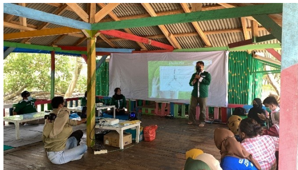
Figure 6 . Delivery of training materials

This activity began with the registration of the participants at 09:30. The first thing the participants did was to fill out the attendance list serving as a recapitulation of the participants, which can be seen in Figure 4. Afterwards, the implementation of PKM WIB activities began at 10:00, beginning with the initial evaluation work (pre-test), which the delivery of materials was carried. The pre-test activity can be seen in Figure 5. The material delivered by the PKM TEAM is closely related to forest health monitoring. After the delivery of the material, it was continued with a discussion session. This discussion session lasted for about 30 minutes. Subsequently, the activity proceeded with the final evaluation (post-test). To find out and describe changes in the trainees' understanding of forest health monitoring materials and practices, the team used a comparison between the average percentage of participants and the pre-test and post-test scores (Suci & Jamil, 2019).