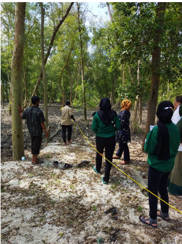
Figure 3 . Forest health monitoring practice

After the community service activity, an understanding level analysis of participants was carried out using a comparison of the initial evaluation (pre-test) and final evaluation stage(post-test) and observation to observe the condition of the target object. Ten questions were used in the test in the activity evaluation and answered by participants. These ten questions consisted of topics on mangrove forests, forest health, and forest health monitoring. During the training, participants were introduced to tally sheets for forest health data collection, which can be seen in Figure 2. This was to make it easier for participants in the future to identify or directly observe forest health.