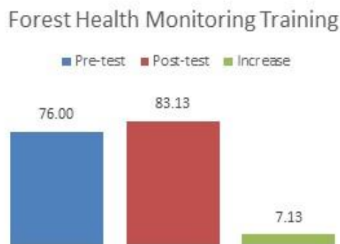
Figure 8 . Average percentage of trainee evaluation results

There were ten questions in each evaluation questionnaire. The results of the pre-test and post-test of forest health monitoring trainees can be seen in Figure 8.