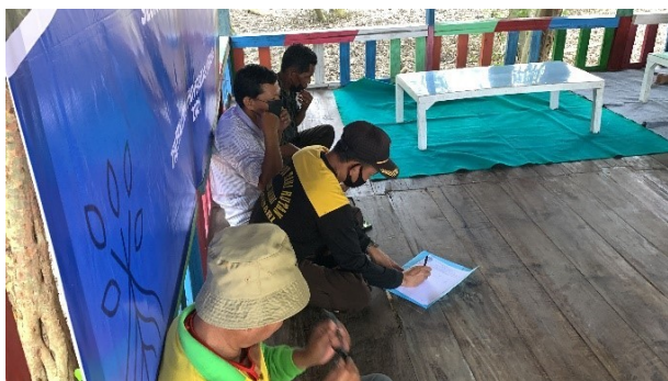
Figure 4 . Participant absenteeism filling

community can be creative and innovative in managing mangrove forest area activities with qualified knowledge. Stakeholders are external components that can help in this regard. One of the efforts that external parties can make is to conduct training and mentoring activities for the community, especially the management community. The UNILA PKM team carried out training activities in Mangrove Forest Tourism, Margasari Village, Labuhan Maringgai District of East Lampung Regency. The targets of this activity were members of KTH Lestari Indah. This activity was attended by the Community Service TEAM, Village Head, Chairman of KTH Lestari Indah, and 20 members of KTH Lestari Indah.