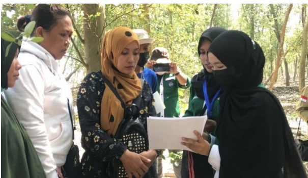
Figure 2 . Preliminary explanation related to Tallysheet's measurement of forest health

This community service activity was carried out on Sunday, October 24, 2021, in Mangrove Forest Tourism, Margasari Village, Labuhan Maringgai District, East Lampung Regency. This community service activity targeted KTH Lestari Indah's members; as many as 20 participants. The method of implementation of these community service activities were in the forms of (1) the provision of materials about monitoring mangrove forests by lecture method, (2) discussions related to materials that have been delivered, and (3) direct practice in the field with forest health monitoring (FHM) methods. Forest Health Monitoring (FHM) is a method of monitoring, assessing, and reporting forest health's long-term status, changes, and trends using measurable ecological indicators (Ajjjah et al., 2022).