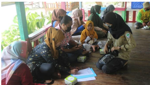
Figure 5 . Pre-test of training done by trainees

This activity began with the registration of the participants at 09:30. The first thing the participants did was to fill out the attendance list serving as a recapitulation of the participants, which can be seen in Figure 4. Afterwards, the implementation of PKM WIB activities began at 10:00, beginning with the initial evaluation work (pre-test), which the delivery of materials was carried. The pre-test activity can be seen in Figure 5. The material delivered by the PKM TEAM is closely related to forest health monitoring. After the delivery of the material, it was continued with a discussion session. This discussion session lasted for about 30 minutes. Subsequently, the activity proceeded with the final evaluation (post-test). To find out and describe changes in the trainees' understanding of forest health monitoring materials and practices, the team used a comparison between the average percentage of participants and the pre-test and post-test scores (Suci & Jamil, 2019).