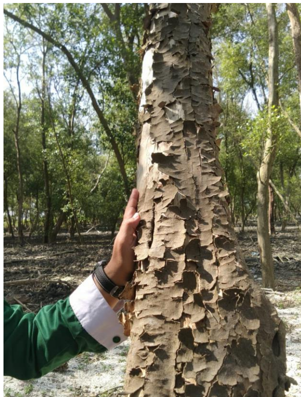
Figure 7 . Example of damage to trees Avicennia

Figure 6 shows the ongoing activity, namely the delivery of the material on forest health. Forest health monitoring practice activities were carried out directly in the field, in the mangrove forest tourism area of Margasari Village. This practice lasted for about one hour. The practice of forest health that was done began with the creation of plots. Subsequently, the activity continued with measuring or observing forest health indicators. Some indicators of forest health that could be observed were productivity indicators with variables of LBDs and volume, vitality indicators with variables of header conditions and tree damage, biodiversity indicators with flora and fauna biodiversity variables, and tread quality indicators with variables of pH values and soil KTK (Safe'i et al., 2019). Based on the observations in forest health training activities, one of the diseases found in mangrove trees was open wound disease; it can be seen in Figure 7.