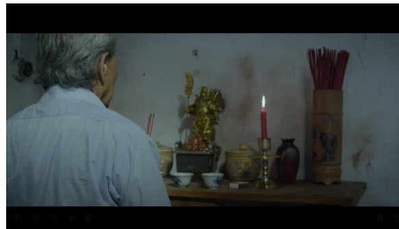
Figure 1. Mei's father is worshipping

detailed in the film analyzed to illustrate how the storyline of "WEI" within the framework of Tzvetan Todorov's model focuses on the value of tolerance between religious communities (Mukraf & Arifianto, 2023). Several visuals can explain the meaning of tolerance in the film WEI.