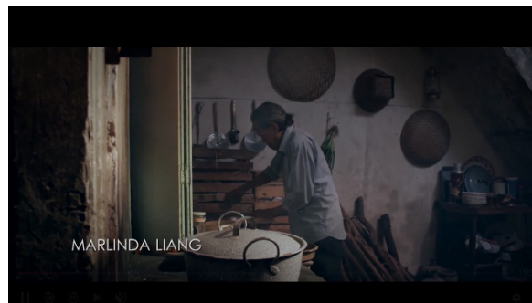
Figure 2. Mei's father is cooking soup for her sale