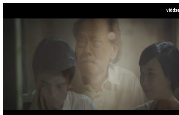
Figure 4. Mei's father looked sad, because he remembered his late wife