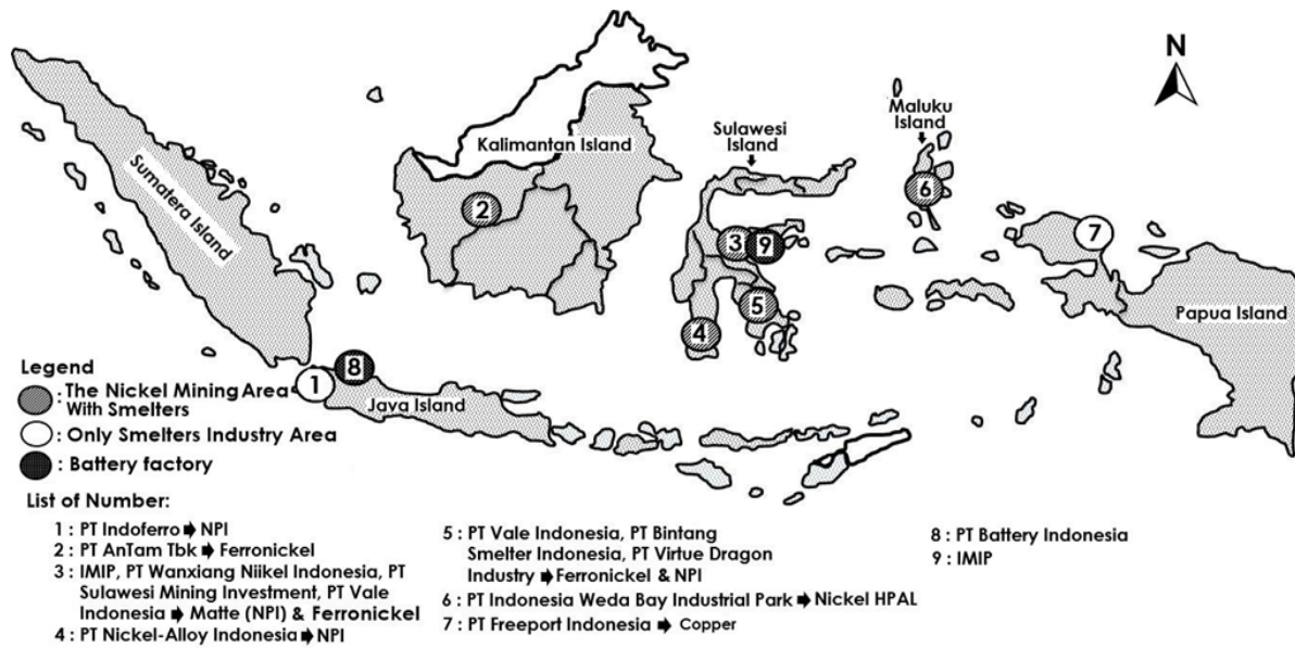
Figure 1. The Nickel Mining Area, Smelters and Battery Factory in Indonesia

Sixth, democratic governance is critical, aimed at checks and balances between all actors in the process. All actors have equal positions in the process; no actor is more powerful than the others. They will have the optimal capacity to contribute to the governance process according to their skill and expertise.