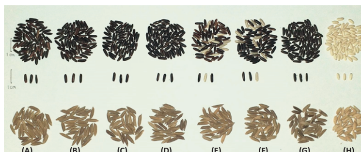
Figure 3. Grain morphology of the selected lines and two checked varieties, (A)= line 482-1-14; (B)= line 487-24-8; (C)= line 482-9-134; (D)= line 482-1-4; (E)= line 482-17-7; (F)= line 482-17-18; (G)= Black Rice cv Cilacap and (H)=: Mentik Wangi)