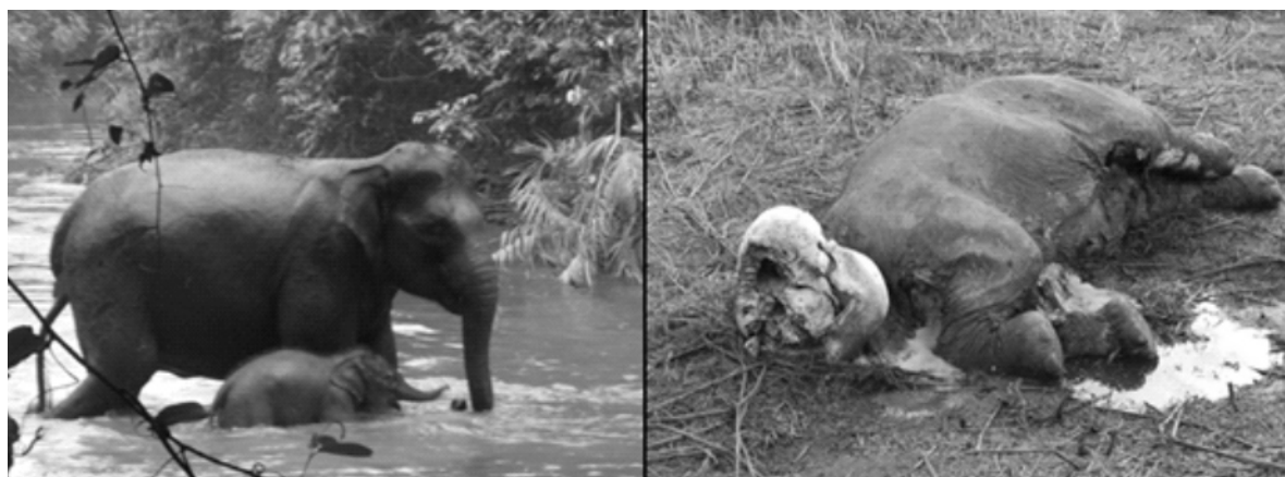
Fig. 2. Sumatran elephants in Bukit Tigapuluh: a cow with calf following her herd into the dense jungle after taking a bath and feeding on water plants (left), and the already decaying remains of a subadult bull that was shot by poachers in order to cut off his small tusks (right).