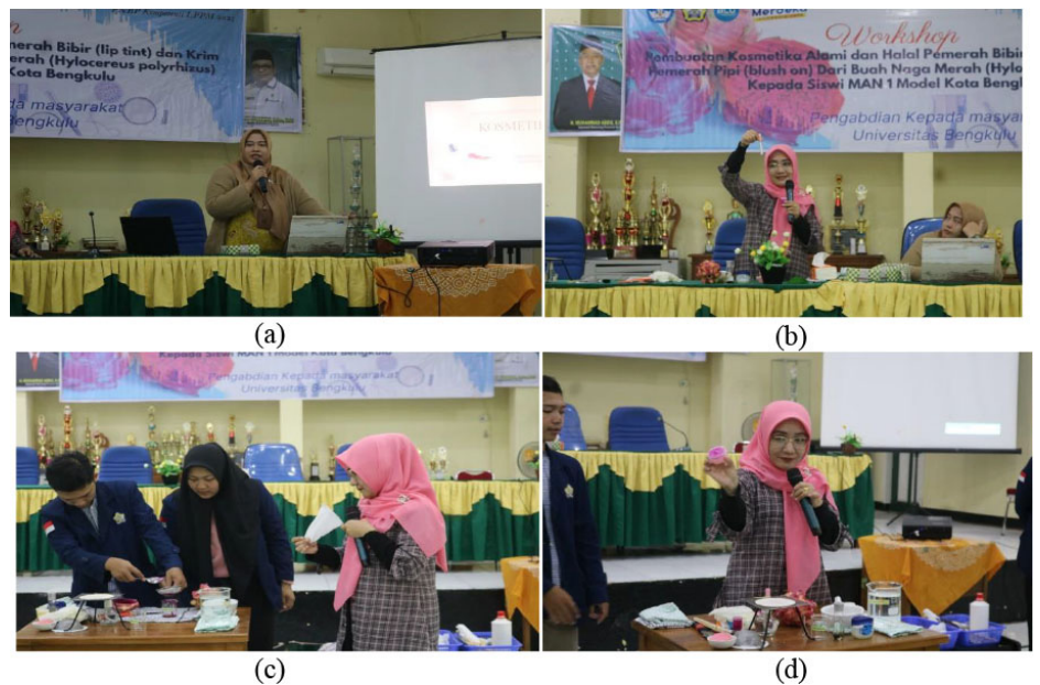
Figure 2. Demonstration of Crafting Cosmetics. (a) Education about illegal cosmetics by a doctor. (b) Explanation of the benefits of red dragon fruit. (c) Demonstrate how to create lip tint and blush on dragon fruit. (d) Pharmacists showcased the packaging process in the respective containers.