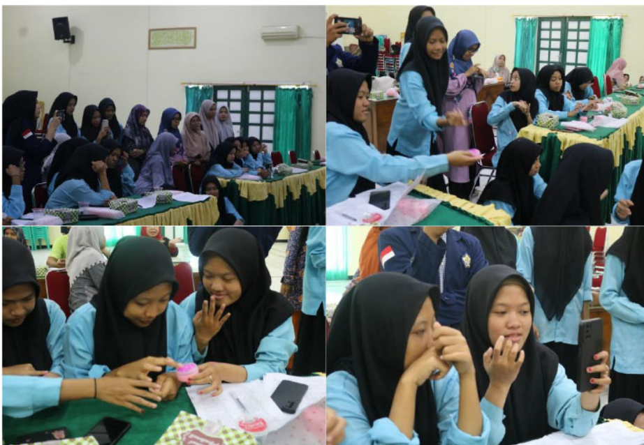
Figure 5. The participants were interested in making natural dragon fruit cosmetics and products from their own handmade.

which contains anthocyanin compounds known for their antioxidant properties (Figure 2b). The various materials and tools used were demonstrated visually, with the instructor showing the form and function of each item (Figure 2c). The female students were encouraged to observe while the faculty members demonstrated the lip tint and cream blush preparation techniques. At the end of the preparation demonstration, the instructors showcased the packaging process in the respective containers (Figure 2d).