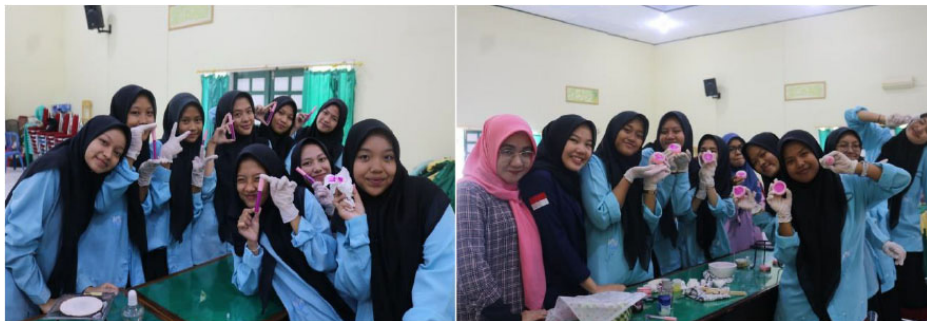
Figure 6. Lip tint and blush products made by the workshop participants from dragon fruit.

highlights the importance of community engagement and its role in shaping the youth's aspirations and awareness.