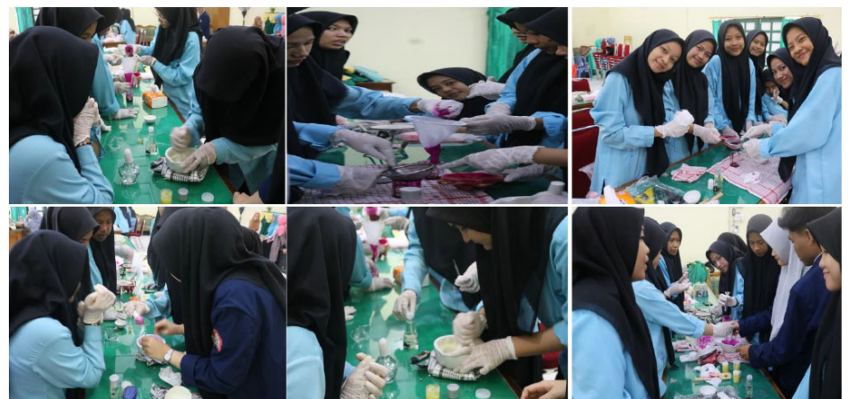
Figure 3. Supervised the creation of natural dragon fruit-based cosmetics, namely lip tint and blush on, provided to the female students of MAN 1 Model Bengkulu by the Community Service Team from the University of Bengkulu.