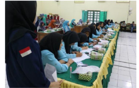
Figure 1. Participants were answering pretest questions.

The workshop activities commenced with explaining the benefits of red dragon fruit,