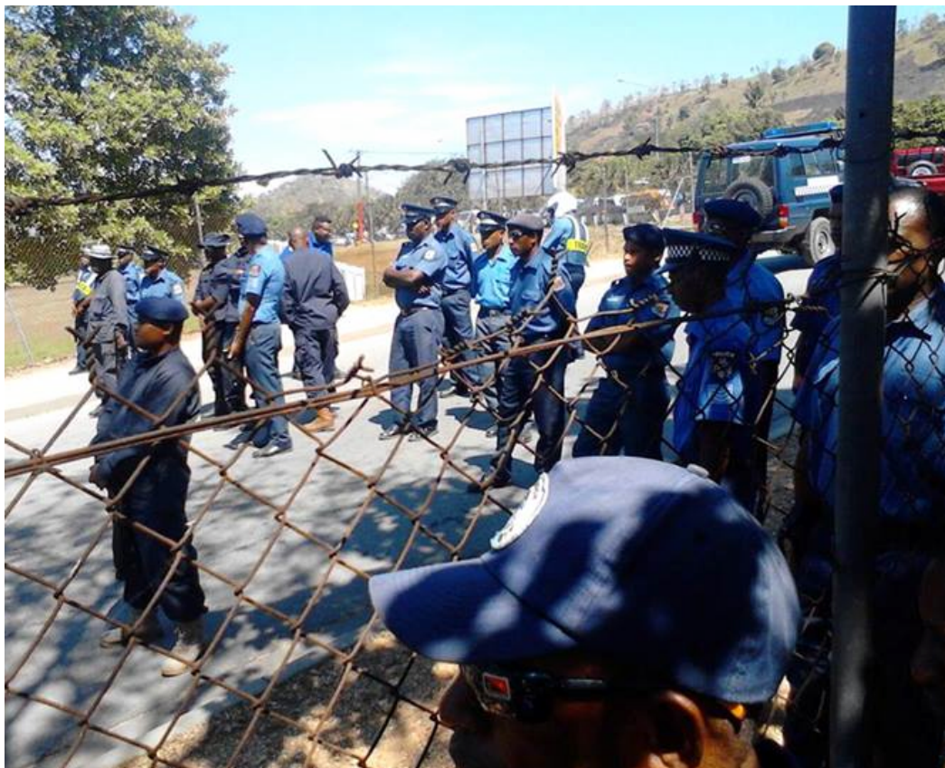
Figure 1. Papua New Guinea police blockading the entrance to the University of Papua New Guinea, where the award-winning Uni Tavor was published and where Asia Pacific Report has a network of correspondents.

This shrinking mainstream media plurality in New Zealand provides a context for examining publication of campus-based media based at AUT's Pacific Media Centre, where student and faculty editorial staff have successfully established an independent digital press over the past decade. I have been involved with four university-based journalism publications over two decades as key adviser/publisher in Papua New Guinea ( Uni Tavor , 1993-1998); Fiji ( Wansolwara , 1998-2002); and Aotearoa/New Zealand ( Pacific Scoop , 2009-2015; Asia Pacific Report , 2016 onwards) (see Figure 1), and also with a publication in Australia ( Reportage , 1996). I was also one of the two founding lecturers of Te Waha Nui and the associated News Production course at AUT during 2003-2007 and I written extensively about this experience elsewhere (Berney & Robie, 2008; Robie, 2006).