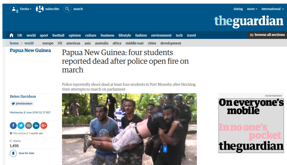
Figure 5: Helen Davidson's article in The Guardian wrongly headlined 'Papua New Guinea: four students reported dead after police open fire on march', 8 June 2016. This was widely rehashed in other news media.