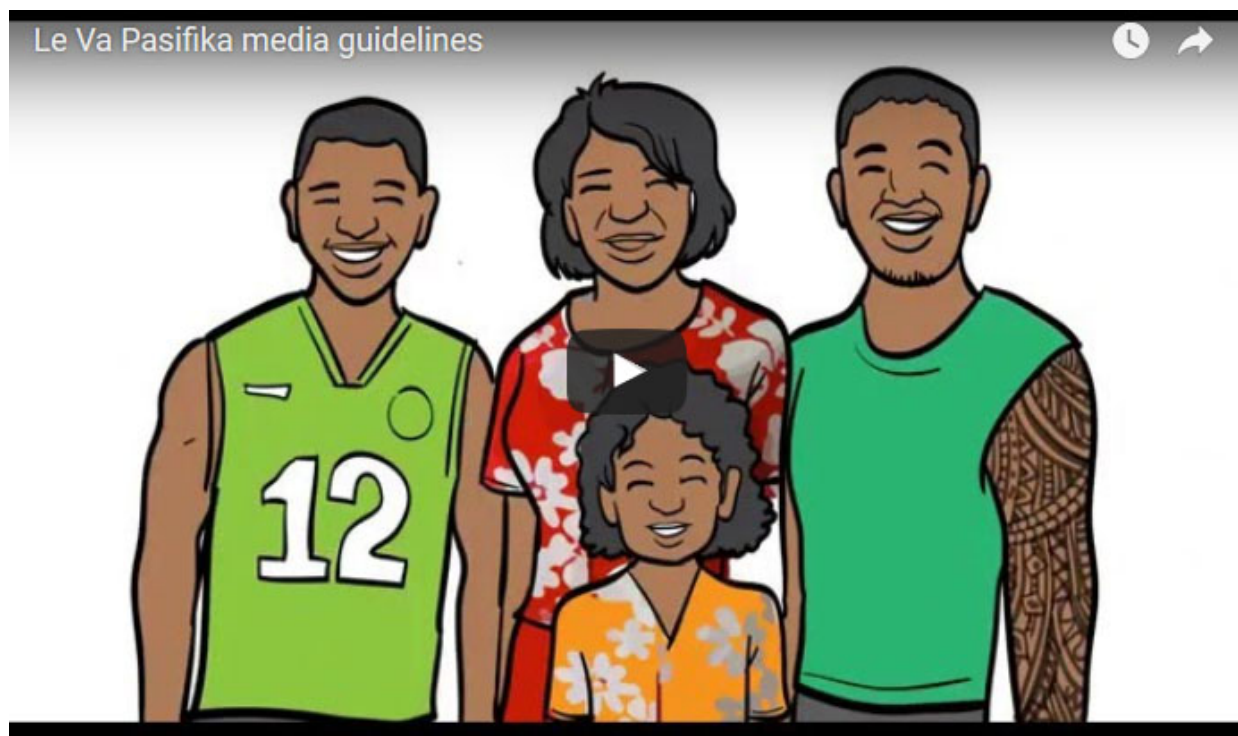
Figure 6: Le Va's Pasifika media guidelines 'whiteboard' video embedded in Asia Pacific Report's articles related to the Samoa Observer transgender suicide controversy, June 2016.