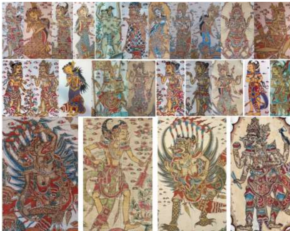
Figure 1. The image displays most of the dataset utilized for testing and training purposes.

Developing relevant and accurate datasets requires a strong and relevant data foundation. Data was collected through observation, interviews, literature studies, and documentation. Observations were conducted in Kamasan Village, a communal village of Wayang Kamasan painting. The objects observed included making Wayang Kamasan, details of the shapes of figures and characters, ornaments, and coloring patterns used. In-depth interviews were conducted with informants (painters) who were determined by purposive sampling. Literature studies were conducted to obtain supporting data from scientific and popular articles about Wayang and other sources relevant to the research objectives. Documentation includes photos, videos, and field notes. Overall, qualitative data is used to determine important variables in the dataset, resulting in a relevant dataset. The resulting dataset consists of 25 Wayang Kamasan images, which are then used as the primary material for the training and testing process of the machine learning model.