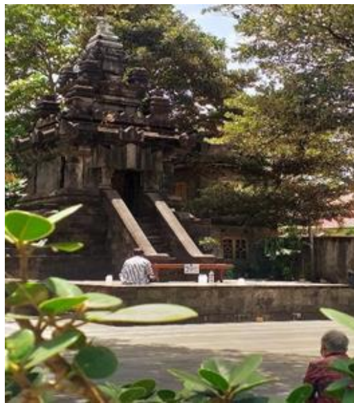
Figure 2. Ganjuran Temple Yard As a Prayer Room for Tourists

This temple was built as a monument to express the Schmutzer family's gratitude to God that the Gondanglipuro Sugar Factory survived the blows of the world economic recession (the malaise era) 8 . Before this temple was built, Schmutzer studied and understood Javanese culture in depth, so the temple built both in its architecture, reliefs and south-facing position was very synonymous with Javanese philosophy and culture. The date of the temple's blessing (February 11) coincides with the day of Our Lady's Apparition in Lourdes, the relationship between this date is one of the factors that builds the sacredness of the temple. The inauguration of the temple has also put it on par with famous pilgrimage sites in Indonesia such as the Mary Cave in Sendangsono. This temple is expected and intended as a widespread Catholic devotion.