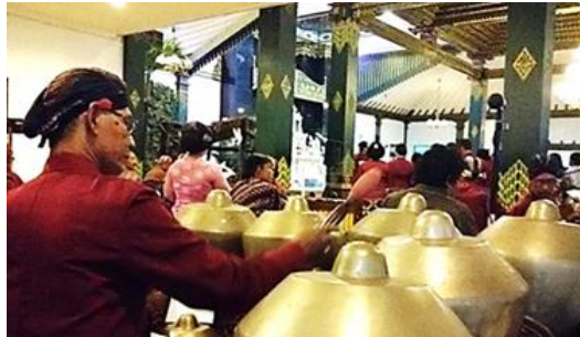
Figure 5. Gamelan Music Playing at the 2015 Christmas Eve Mass