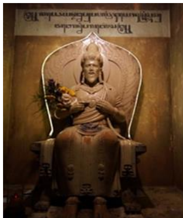
Figure 7. Statue of Jesus in the Ganjuran Temple

Simultaneously with the ceremony of laying the first stone of the temple, the priest blessed the statue of Jesus Christ in the form of the "King of Java" and highlighted the symbol of the Sacred Heart of the Lord Jesus on the chest of the statue. The statue of Jesus in the church is usually placed standing, but the statue of Jesus in the temple is seated on a throne over the padma, showing the degree and power of Jesus as a king 9 . This is supported by Javanese title on the statue, which reads " Sang Maha Prabu Yesus Kristus Pangeraning para Bangsa " (You are Jesus Christ the King of All Nations). The attire worn on the statue of Jesus is also typical attire of Javanese kings with a crown on their heads 10 .