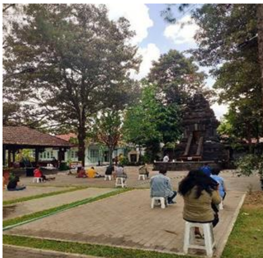
Figure 3. Ganjuran Temple Building As a Place to Pray for Tourists

The role of the temple in shaping the experience of religious pilgrimage tourism also occurs in Dian, a tourist who is neither Catholic nor Javanese. Dian feels there is a connection between her Hindu identity and the Hindu elements found in the temple. As a Hindu, she is used to praying in front of a temple that visually resembles a temple in shape and appearance and the characteristics of an outdoor prayer room. Not only the temple but also the temple yard, which also functions as a prayer room in this church complex has much in common with Hindu prayer halls. That concept of the temple and temple courtyard as “prayer room” in the open nature reminds her of one of the values of Hinduism, namely the value of being one with nature.