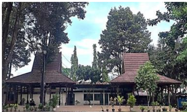
Figure 8. Two Schmutzer Pavilion Buildings