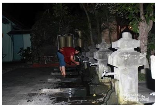
Figure 6. The Practice of ‘Wudu’ Using the Holy Water of Tirta Perwitasari