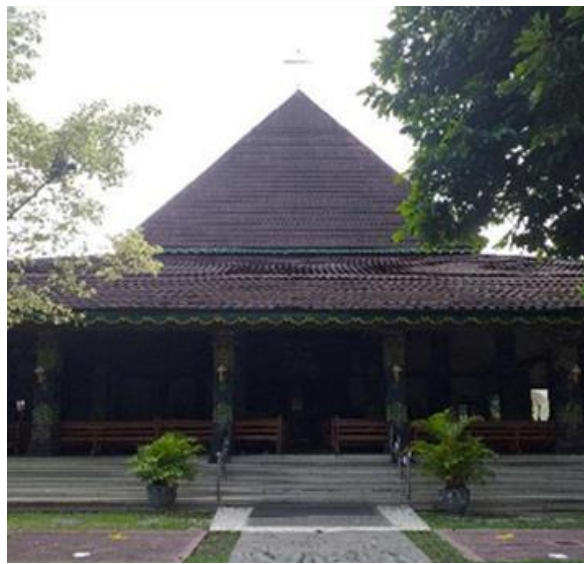
Figure 4. Ganjuran Church Building in the Form of A Joglo

This church, similar to Keraton (a type of royal palace in Java, Indonesia) was founded in 2009 and the first stone was laid by the Archbishop of Semarang at that time. For Schmutzer, founding a church allowed the Catholic religion, which at first seemed distinct from the surrounding 'identity' more dominant in other religions, could merge and become 'a new identity' within the community, especially in the Ganjuran area. The adoption of Javanese architectural styles such as Joglo houses with an interior design full of Javanese nuances and knick-knacks resembling the Keraton gives a strong impression that the Ganjuran Catholic church can exist and create a different identity that makes the community around it more dynamic.