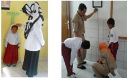
1. Agent to promote and increase health status of school children.