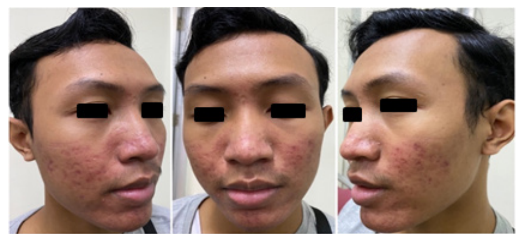
FIGURE 4. Patient's face after therapy, showing atrophic erythematous scar of the ice pick type, box scar, and rolling scar in the malar, glabellar and mandibular regions,