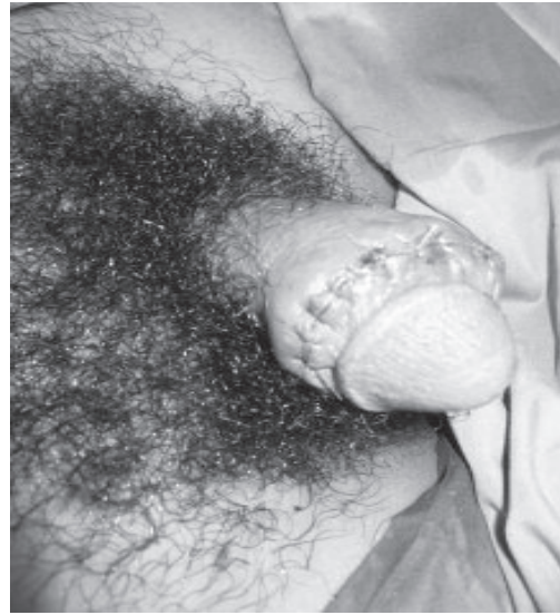
FIGURE 2: postoperation

The histopathology result showed skin tissue penis with swollen granulomatous pseudotuberkel form that surrounded by empty spaces such as fat named plasma cell, numerous, large, clear vacuoles