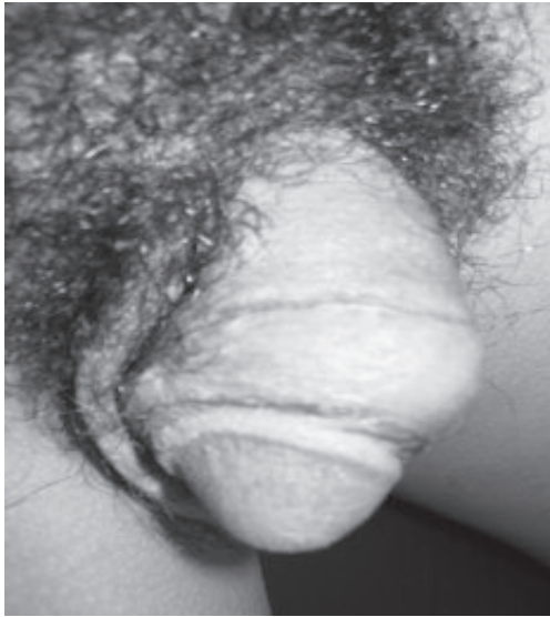
FIGURE 1: before operative condition

On physical examination, it was found the skin on the distal part of the penis was enlarged with a diameter around 5 cm when it was not erected, the consistent expression a circular solid mass was felt, looked at the color like the color of the skin around it, there were not suppressed pain, and signs of inflammation on the penis and surrounding organ (FIGURE1). According to the anamnesis and physical examination the proposed diagnosis was a granuloma on the penis caused by liquid silicone injection.